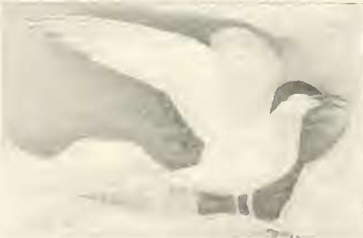
Roseate Tern Sterna dougallii

Breeds Aride, African Banks, Etoile and possibly Farquhar. Annual elsewhere.